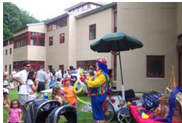
2007 Scavenger Hunt Party

Adults and kids can register beginning July 6 th at 10AM at the Adult Information Desk. You will receive a list of items to gather, as well as the rules of the game. This is a 3-week Scavenger Hunt, so you can register anytime between July 6-July 20. The Hunt ends July 22 nd at 3PM.